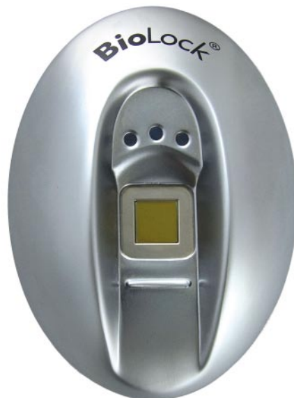
BioLock available in Silver or Black